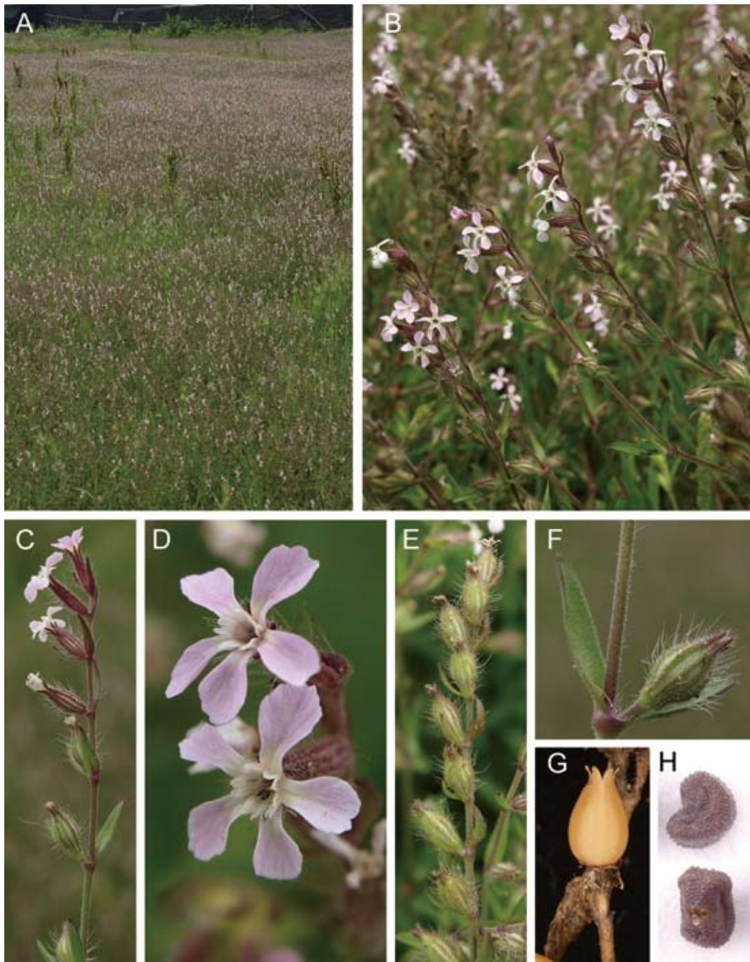
Fig. 2. Silene gallica L. (A) Habitat; (B) habit; (C) inflorescence; (D) flower; (E) infructescence with immature capsules; (F) immature capsule; (G) mature capsule; (H) seeds.